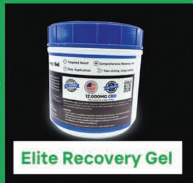
Elite Recovery Gel

Buy one Thrive Equine Product Get a FREE Restore Roll-On Gel