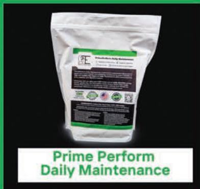
Prime Perform Daily Maintenance

Shop Thrive Equine's premium line of veterinary CBD products for horse recovery, stress management, and performance improvement.