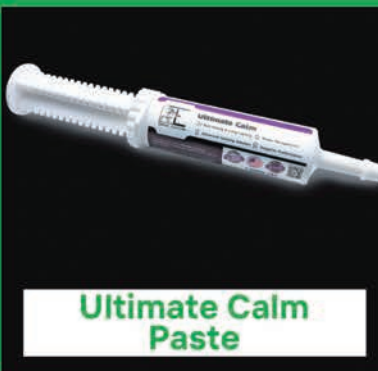
Ultimate Calm Paste